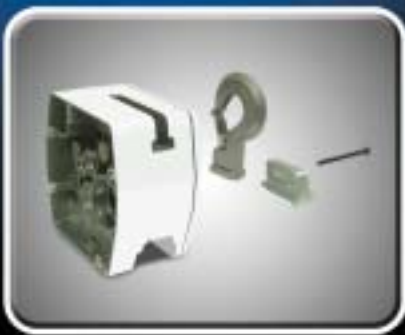
Easy Change Top Suspension