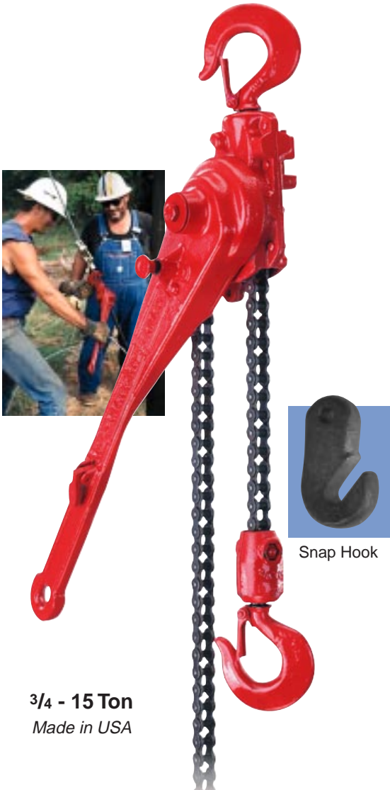
3/4 - 15 Ton Made in USA

COFFING G Series Model - Malleable iron roller chain ratchet lever hoists are efficient and durable. Roller chain can be spliced to create longer lifts and can handle higher capacities than coil chain. G Series hoists are ideal for utility transmission and distribution work.