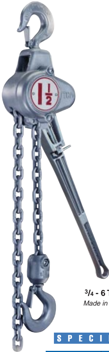
3/4 - 6 Ton Made in USA