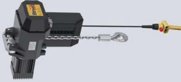
LX EYE SUSPENSION HOIST

Standard headroom and eye suspension models optimise side hook approaches but for those applications where upper hook position is critical in a restricted roof height the Street low headroom hoist with chain diverter trolley provides an unbeatable compact solution.