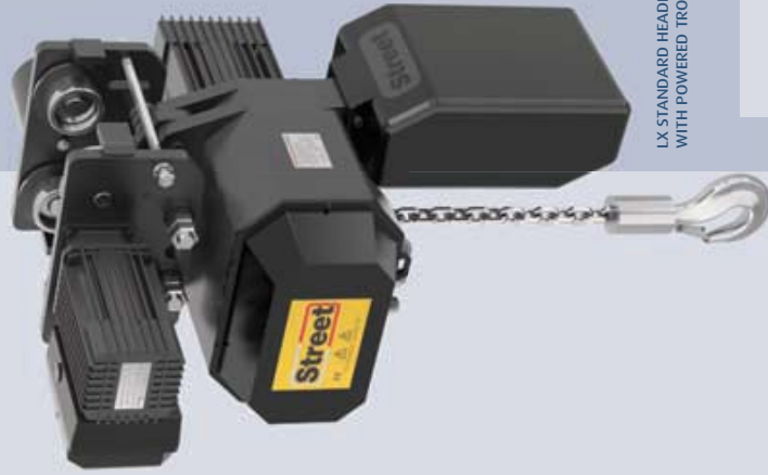
LX STANDARD HEADROOM HOIST WITH POWERED TROLLEY