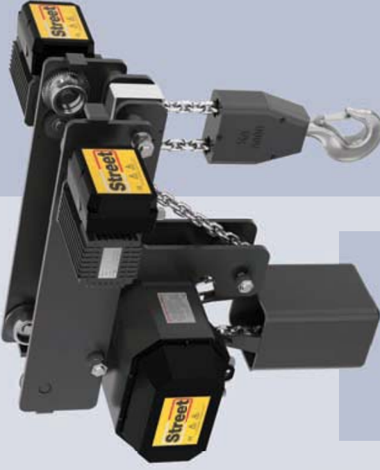
LX LOW HEADROOM HOIST WITH POWER TROLLEY