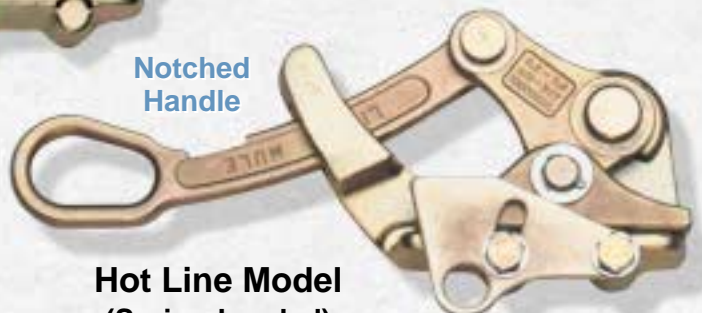
Hot Line Model (Spring-Loaded)