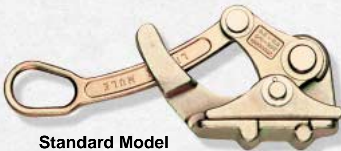
Standard Model (Spring-Loaded)