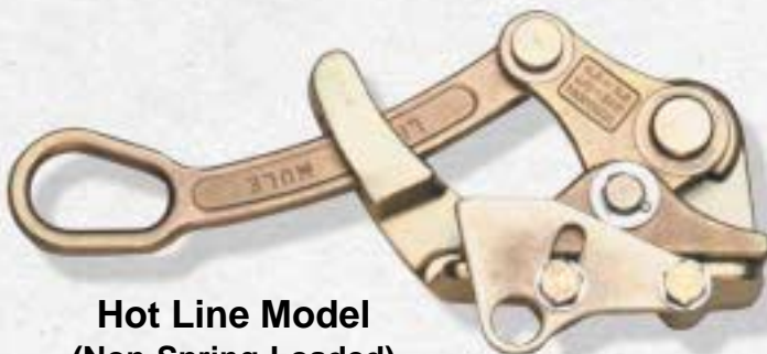
Hot Line Model (Non-Spring-Loaded)