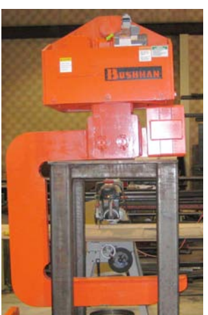
Motorized rotating C-hook sitting in its stand